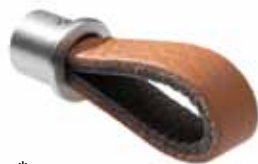
*cognac and mocca