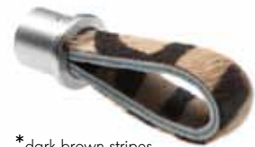
*dark brown stripes