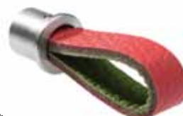
*red and green