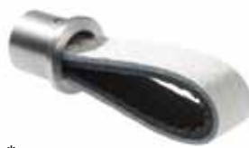
*white and black